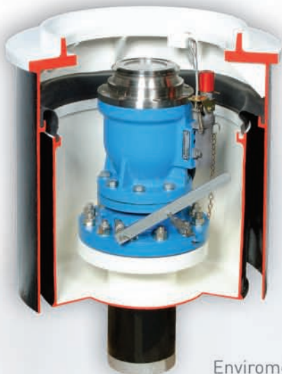
Enviromental pit box