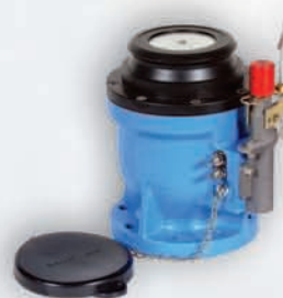
Hydrant pit valve