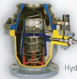
Hydrant pit valve

Whittaker has a global product support presence through an extensive network of stocking distributors. The company's state-of-the-art in-house test facilities simulate the actual operating environment of its products, thus ensuring that hardware meets customer quality standards and requirements.