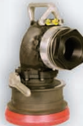
Pressure control coupler