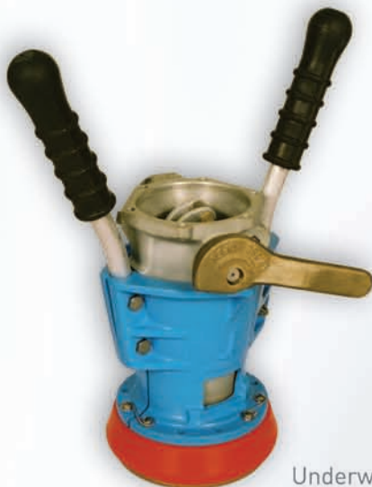
Underwing refuelling nozzle