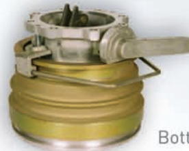
Bottom loading coupler